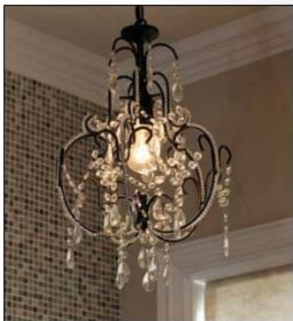
The homeowner's foremost request for her handsome, sleek master bath: one strongly feminine element in the form of a crystal chandelier.