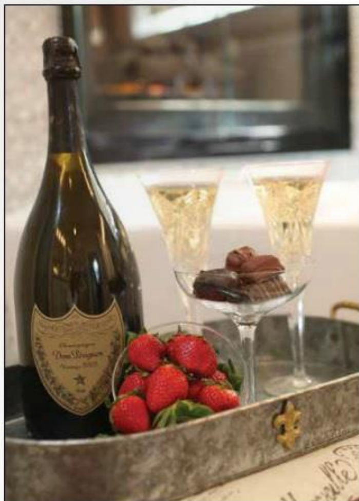
Amp up the romance quotient with chilled Champagne, fine chocolates and fresh strawberries, then burn a scented candle for even more allure.