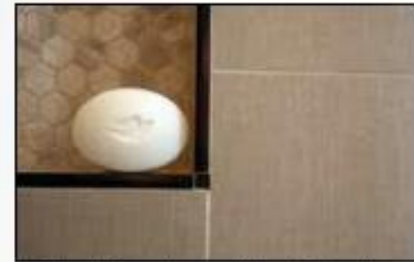
Simplicity and clean lines define the shower and vanity, including a niche that neatly corrals all manner of shampoos and soaps.