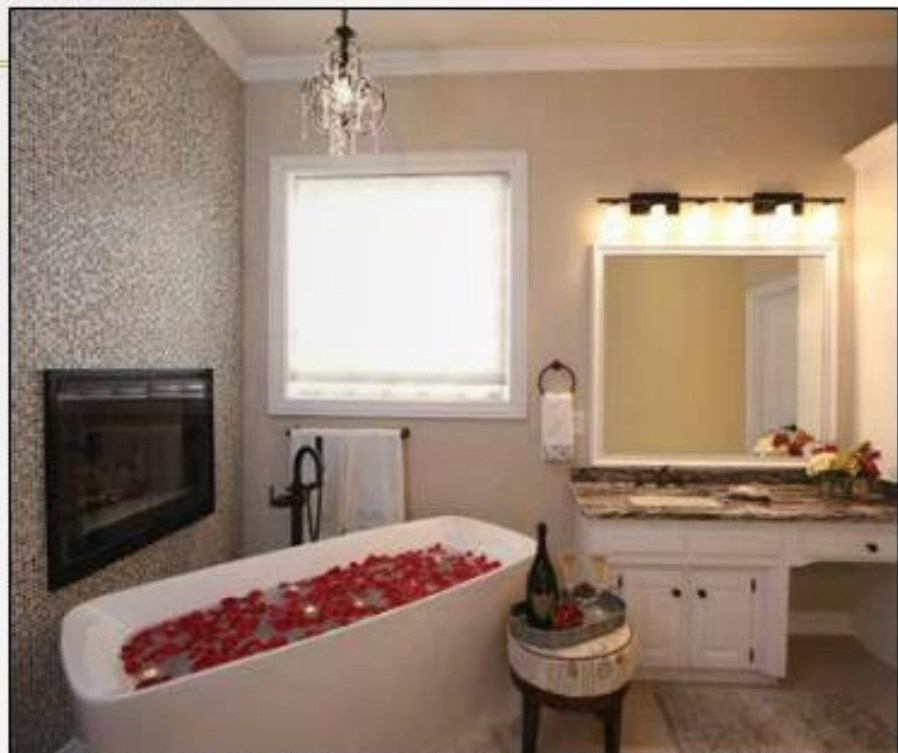
Accessories including the pretty chandelier and red rose petals strewn in the bath transform the space into a sensual retreat.

"I wanted a chandelier, not a huge one, but something